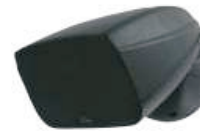
Motion Sensor A planar technology microwave detector working in the K band. Sensitivity and direction programmed by DIP switches.