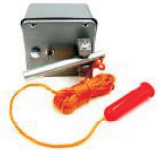
Pull Cord Pivoting cam to accommodate angle of pull.