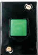
Single Button / Single Pole Switch Used in conjunction with the RC200 and remote for wall activation.