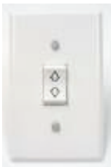
Constant Contact Switch A single pole, double throw rocker switch