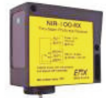
Transmitter and Receiver Photo eyes Microcontroller-based device uses thru beam detection.