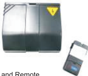
RC200 and Remote Transmit over 300 feet. Run timer with automatic shut off. Radio control remote with sequence controlled switching available in 2 and 4 channel.