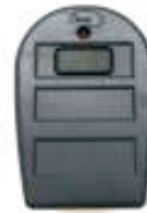
Remote Control Single button transmitter for operation of one door. Comes with L.E.D. battery life indicator.