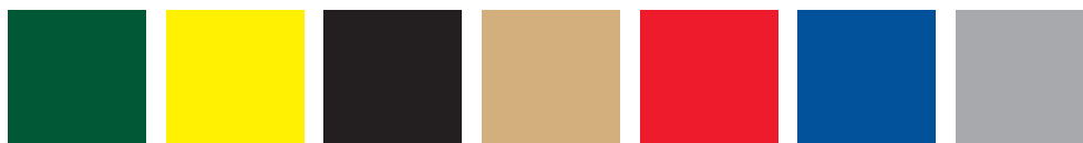
Hunter Green Yellow Black Tan Red Blue Grey

Screen • High strength vinyl coated polyester 17 x 11 weave screen.