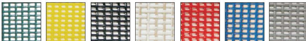
Hunter Green Yellow Black Tan Red Blue Grey